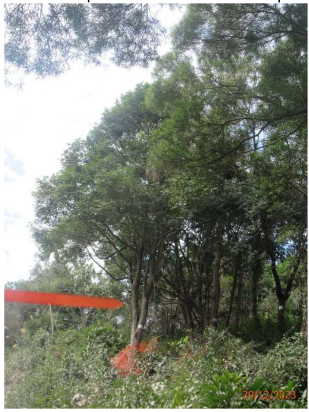
WLH_T047 Aquilaria sinensis Observed since November 2023