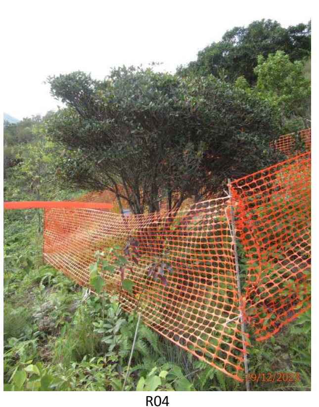
Enkianthus quinqueflorus Observed since November 2023